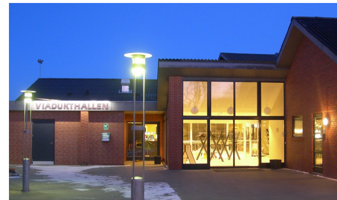
Viadukthallen Filskov, sports center and culture house, opened 2004