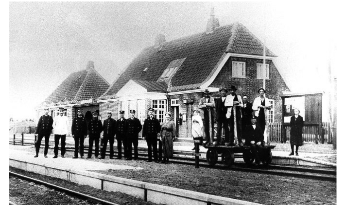
Filskov railway station, opened 1917 and closed 1971

An almost ordinary village in Jutland 15 km from Legoland and Billund